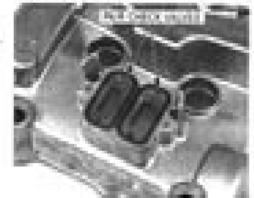
PAF CHECK VALVES

Remove the PAF check valves from the cylinder head cover. Check the PAF check valves for wear or damage, replace if necessary.