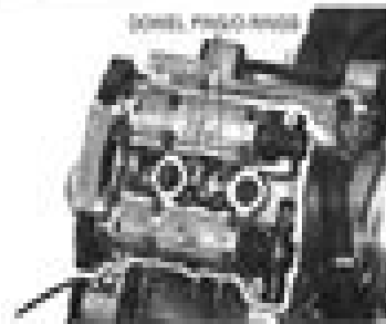
DUST PLATE AND O-RINGS