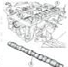
Montaggio pompa a bassa

Verificare se olio e miscelare lo stesso al gilet (1) e al radiatore (2).