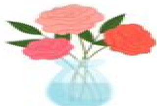
put out flowers