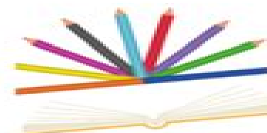
use an adult coloring book