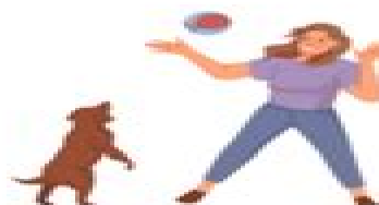
play with your pet