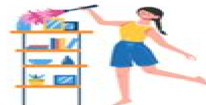
organize a bookshelf