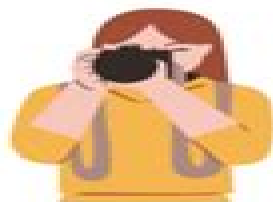
do a photoshoot