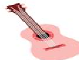
play an instrument