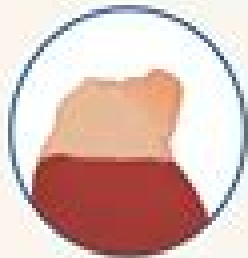
Primary Hyper aldosteronism (Conn's Syndrome)